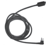
Programming Cable (USB Port) PC26