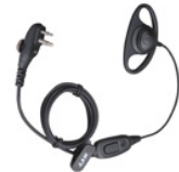
D-Earpiece with In-Line MIC, PTT, & VOX EHM15